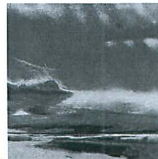
Grade Level: Elementary Subject Area: Language Arts, Visual Arts